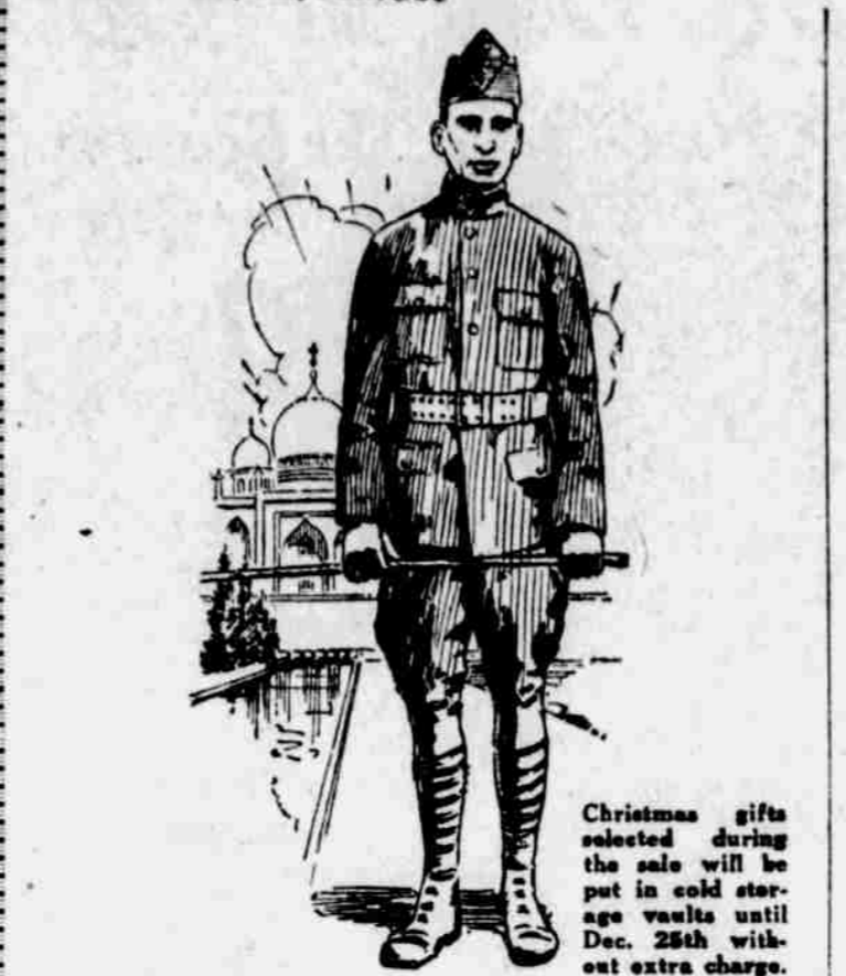
Christmas gifts selected during the sale will be put in cold storage vaults until Dec. 25th without extra charge.