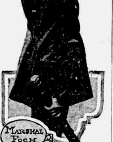
These were repeated for the French war hero.

over the crowds as the two men of war warmly clasped hands. Standing in the open square, the pair chatted as old friends meeting at a railroad