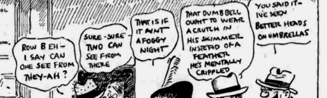
THAT DUMB BELL OUGHT TO WEAR A CRUTCH IN HIS SKINNER INSTEAD OF A FEATHER. HE'S MENTALLY CRIPPLED.

Lincoln, Neb., Oct. 27.—The University of Nebraska foot ball team, its coaches and possibly a faculty member may use the air route in order to insure the team's presence at Pittsburgh, Pa., Saturday, November 5, for the inter-sectional foot ball game between the University of Pittsburgh and the University of Nebraska.