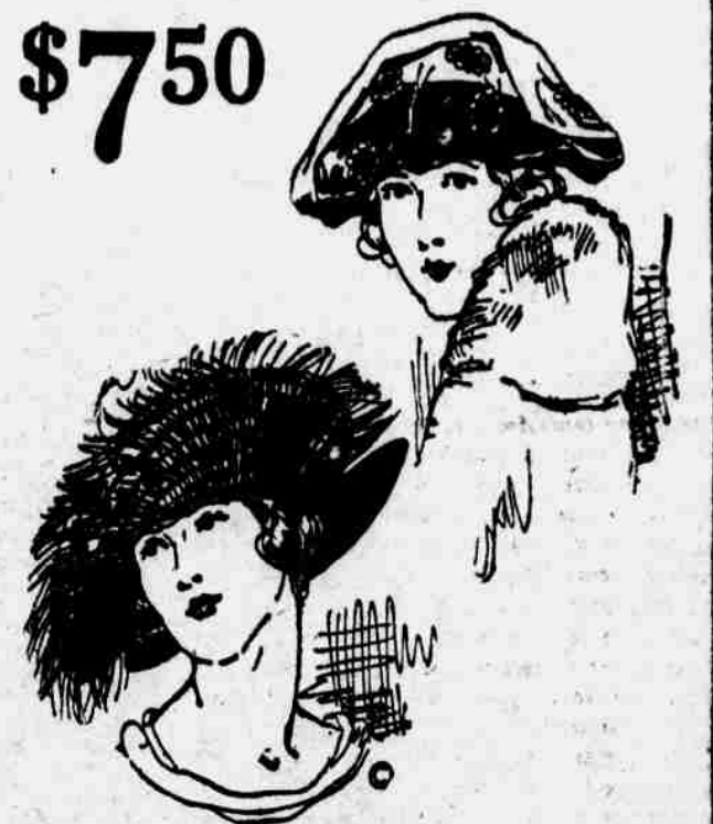
Burgess-Nash Millinery Shop—Third Floor

Moderate in price but equal in quality and style to much higher priced millinery. Velvet hats in black and a wide variety of shades. Smartly trimmed with ostrich, ribbon ornaments or flowers.