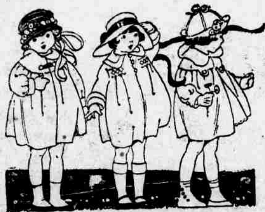
Burgess-Nash Infant's Shop—Third Floor

There are the daintiest imaginable tiny coats of white and pink wool crepes, silks and cashmeres, with hand-embroidered collars and hand-feather stitchings. Lined with silk and sateen. Many interlined. Priced while they last at about wholesale cost. $3.95 and $6.95 each.