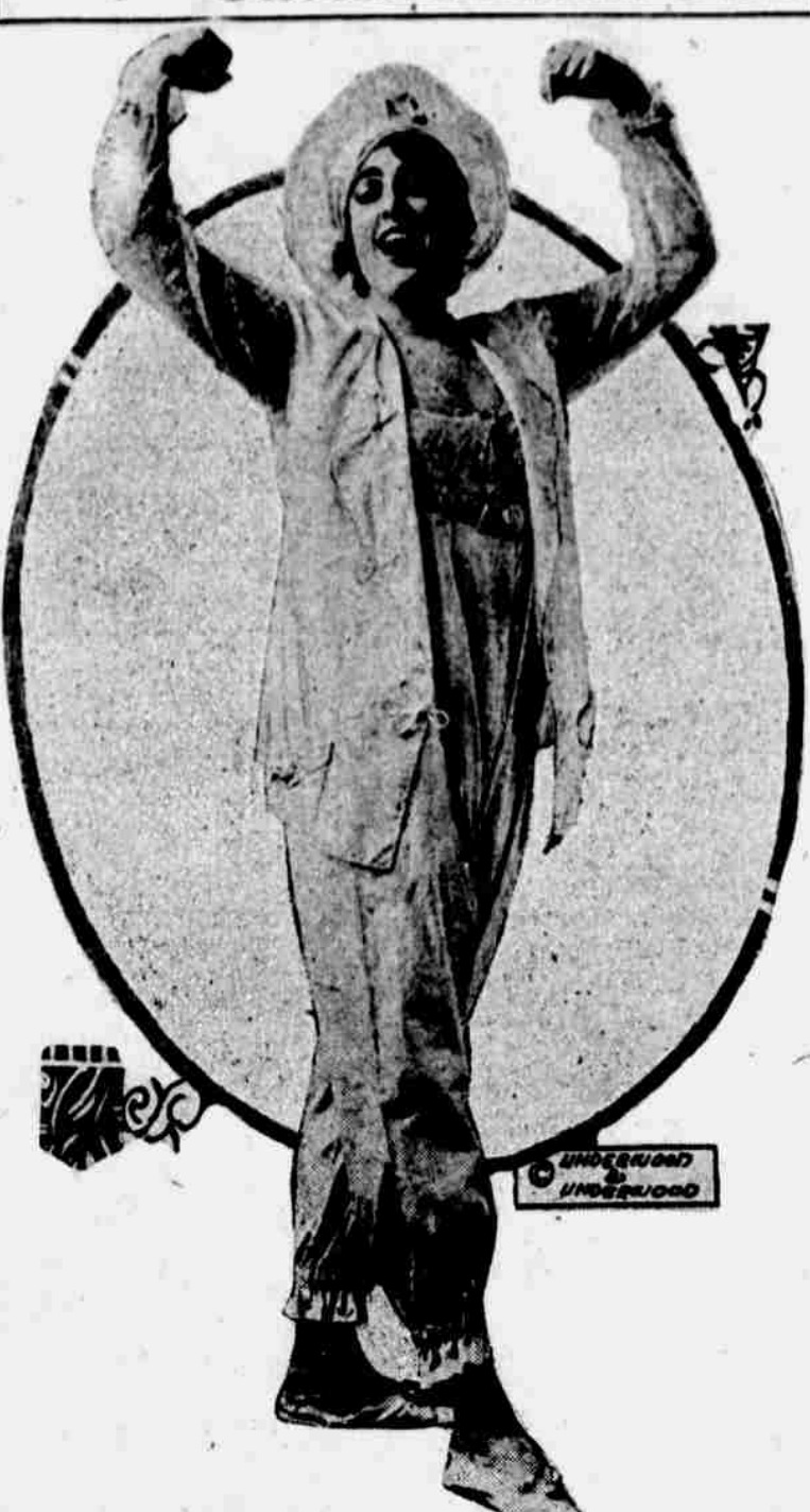
A new photograph of Virginia Rappe, movie actress, for whose death Roscoe Arbuckle is held in San Francisco. This unconventional pose is typical of the types portrayed by her when appearing before the camera.