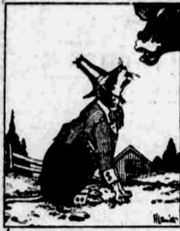
"You know I'm a sporting dog. I'm a pointer."

Nobody ever spoke of old Spot's master as 'old Johnnie Green.' Yet the two—boy and dog—were almost exactly the same age. Somehow Spot grew up faster than Johnnie. He had stopped being a puppy by the