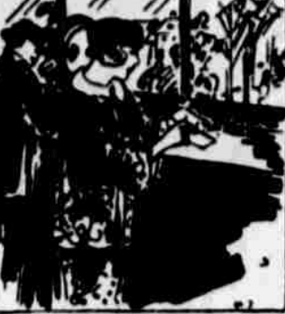
Plain post cards are used only to convey brief and businesslike messages. These cards cost one-half the postage required for ordinary letters.

For this reason, as well as for the accompanying economy of time, mimeographed, printed or written post cards are customarily utilized for notices of meetings.