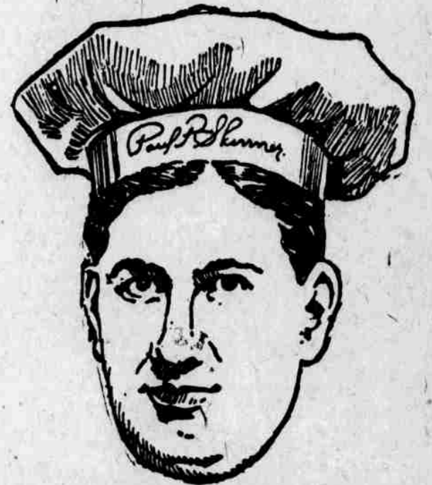
Trade Mark—Registered—U. S. Foreign.

Never again and under no conditions will a fully participating stock be issued in this company and to those who are interested, we advise quick action.