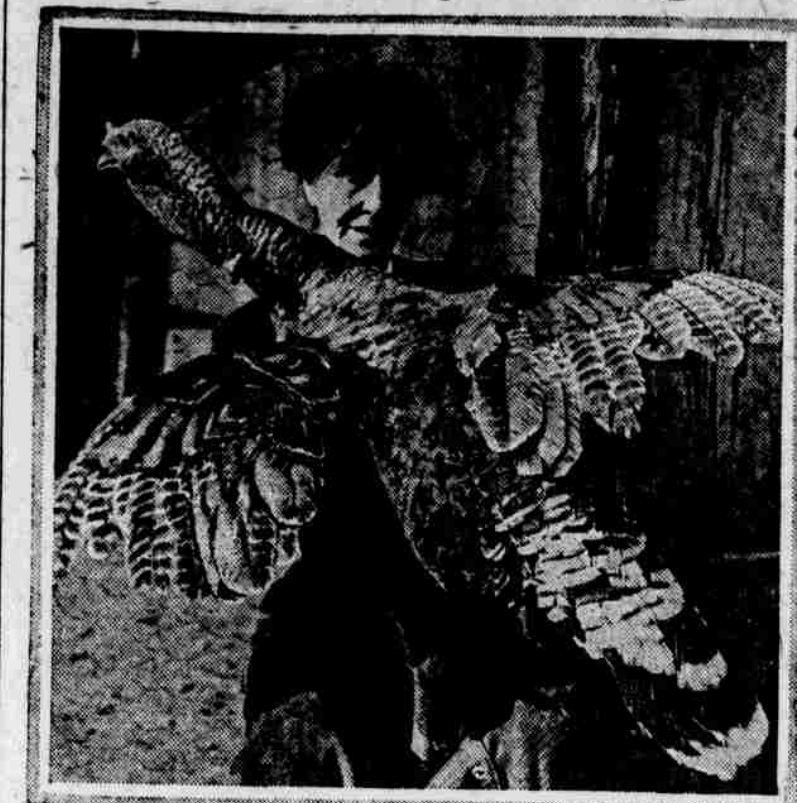
Ready for the "Big Day" One of Nebraska's prize turkeys which is ready for that day of all days, Thanksgiving, which comes next Thursday. "King Turk" is in his glory on that day. But only for a short time. The old gobble is quickly gobbled up himself by the descendants of John Alden.