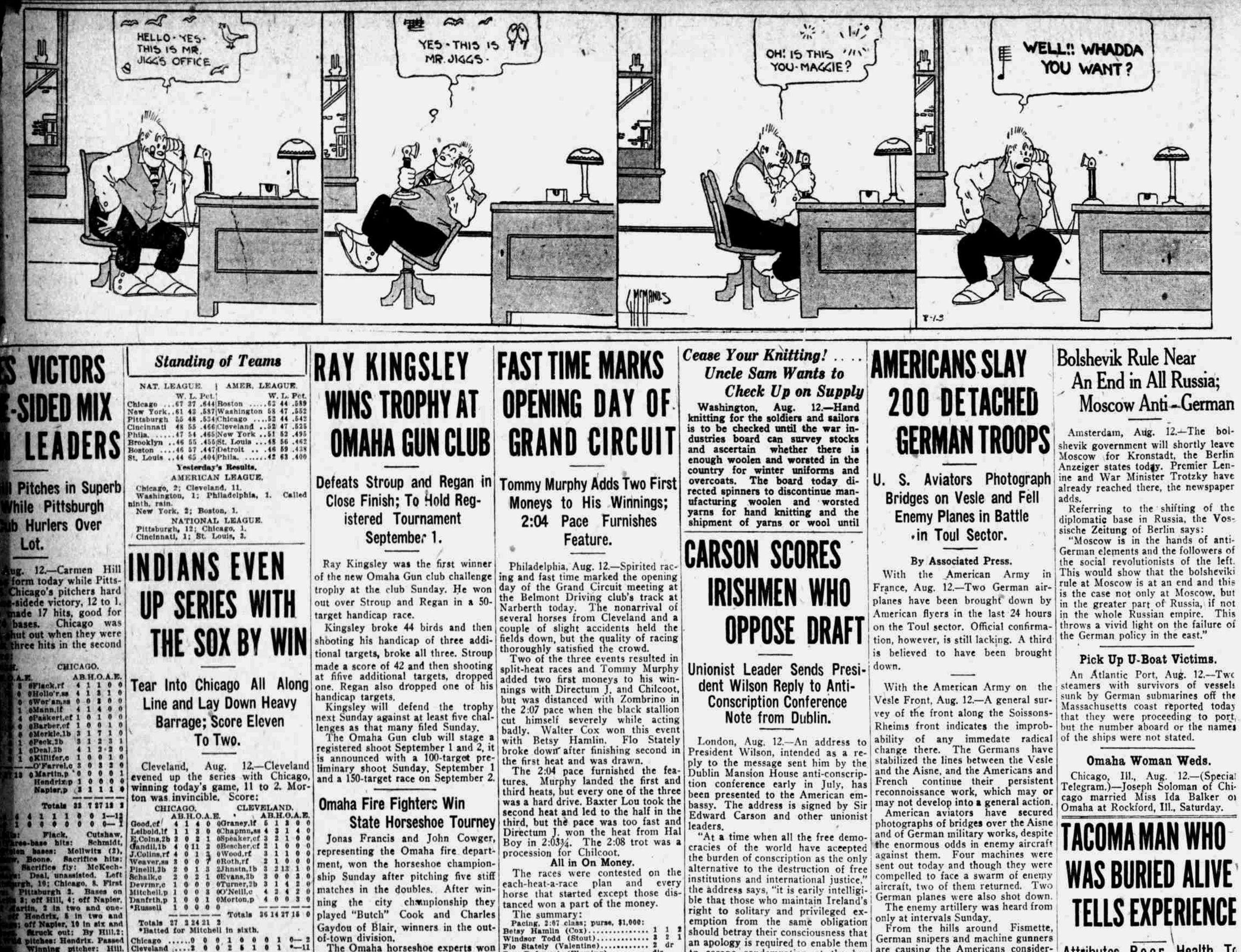
THE BEE: OMAHA, TUESDAY, AUGUST 13, 1918.

Totals 27 2 24 21 2 •Batted for Mitchell in sixth.