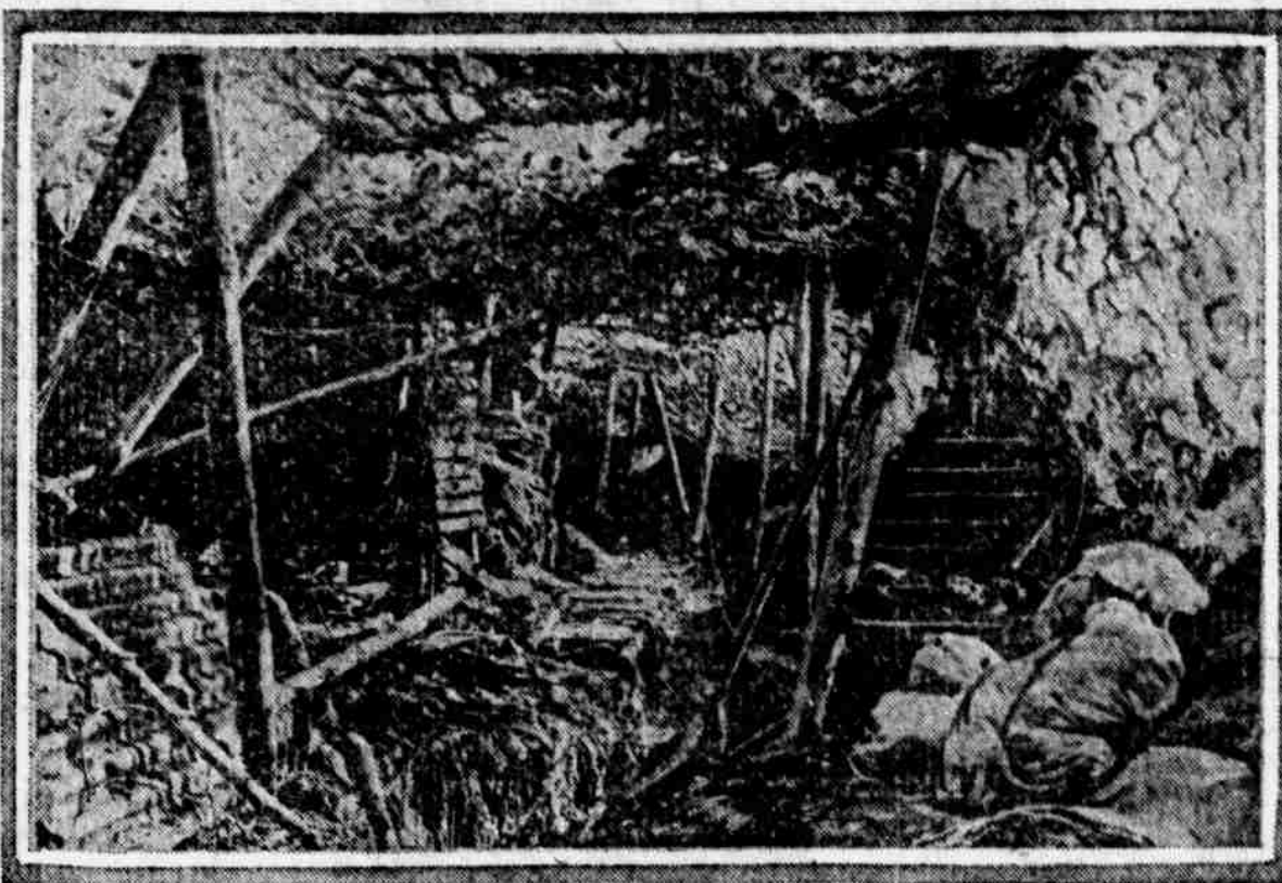
AMERICAN TRENCH AFTER GERMAN BOMBARDMENT. © COMMITTEE ON PUBLIC INFORMATION, APRIL 3, 1918.

This photo shows the condition of an American trench after a fierce bombardment by the enemy, which