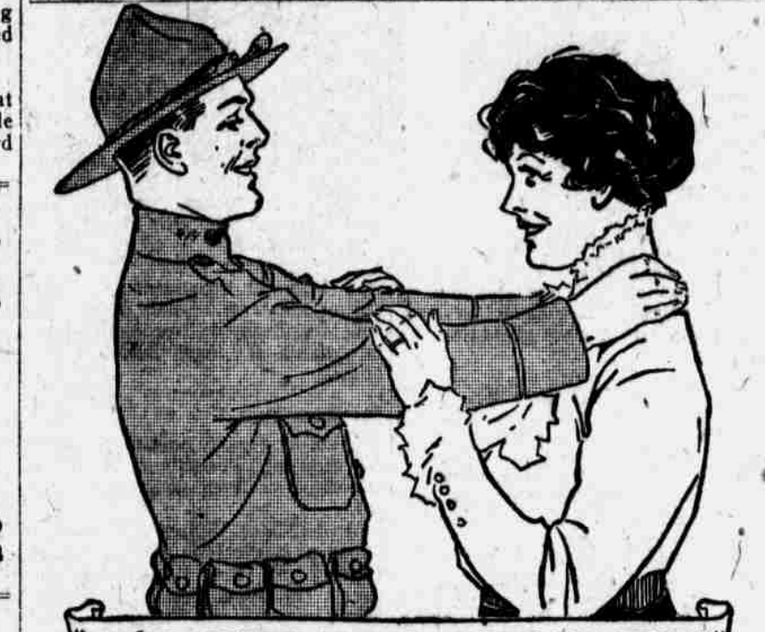
"YOU'RE LOOKING YOUNGER EVERY DAY, MOTHER"

Those who object to liquid medicines can secure Peru-na tablets.