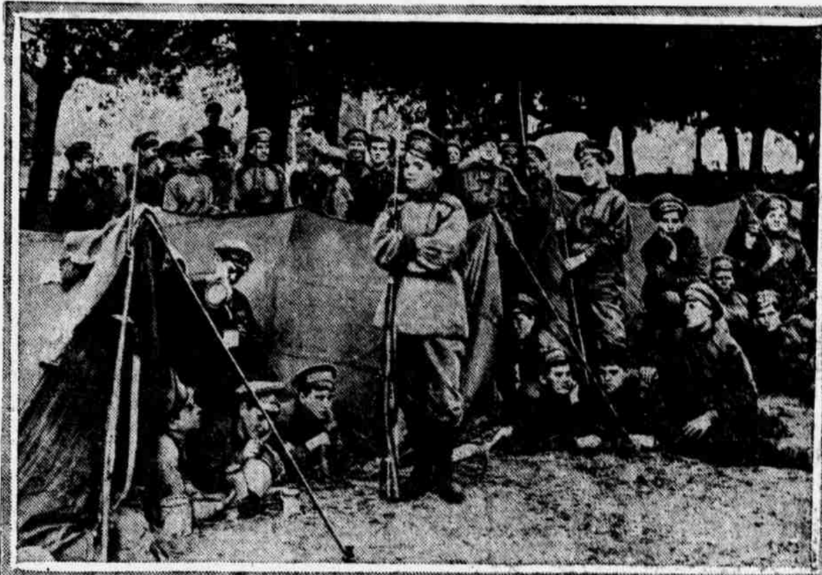
RUSSIA'S AMAZONS CALLED TO DEFEND PETROGRAD.

The famous women fighters of Russia, members of the "Battalion of Death," have been called upon by the Bolsheviki government to defend Petrograd.