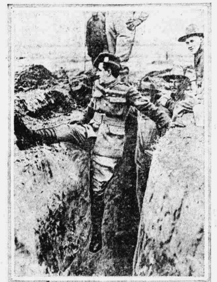
OVER THE TOP.

"Sammy" at one of the national army cantonments getting a line on how to go over the top. The boys are being instructed by a Scotch sergeant, who is a veteran in point of service in the trenches of France, and are benefiting by his knowledge of the war game.