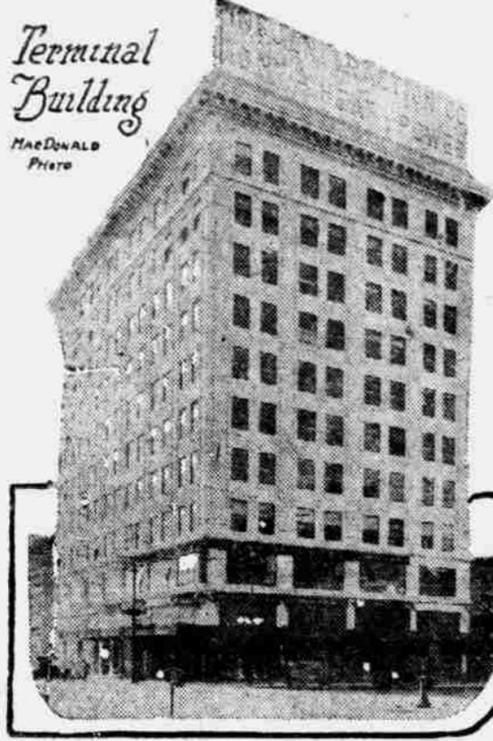
Terminal Building MacDONALD Peters