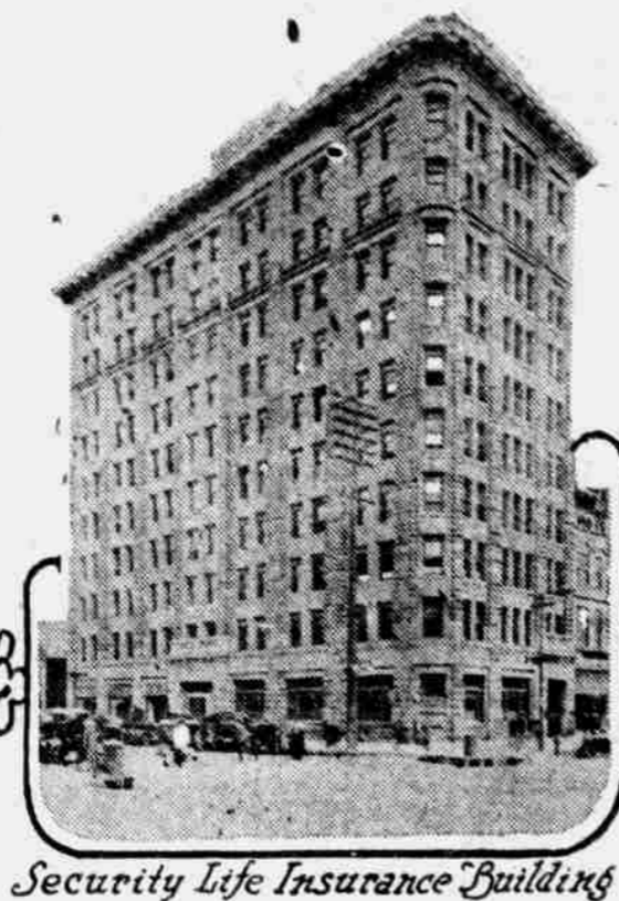
Security Life Insurance Building