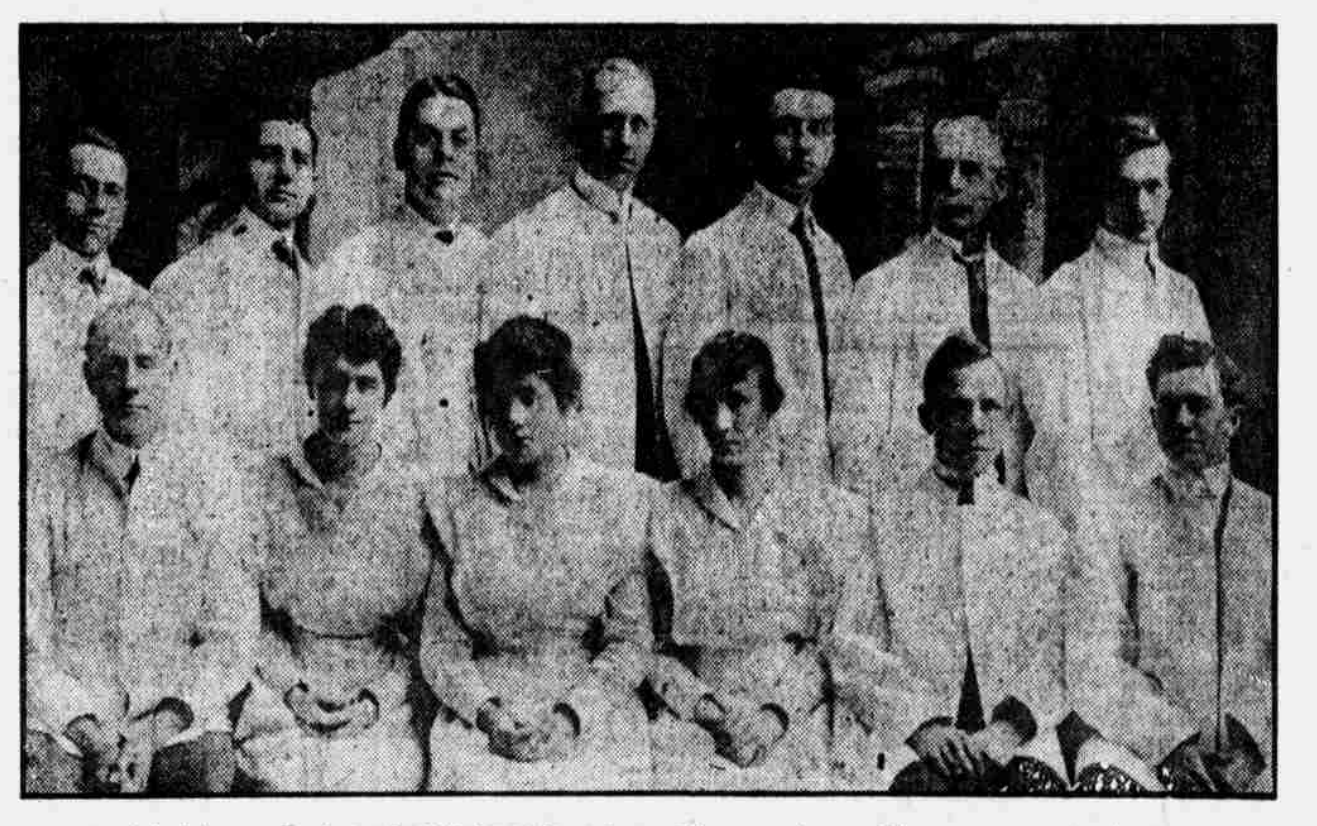
A trained dental nurse is always in attendance in each operating room in my offices as a protection and assistance to women patients. Children requiring attention are looked after by a nurse while mothers are in the operating chairs.

I have no admiration for customs simply because they are hoary and bewhiskered. I do not appeal to your prejudices; I appeal to your intelligence and your sense of fairness. I ask you to lay aside any prejudice you may