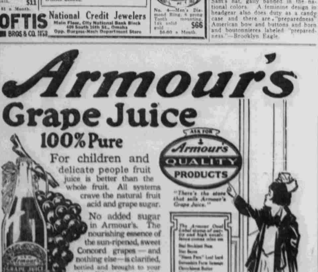
table. Dilute it as you like.