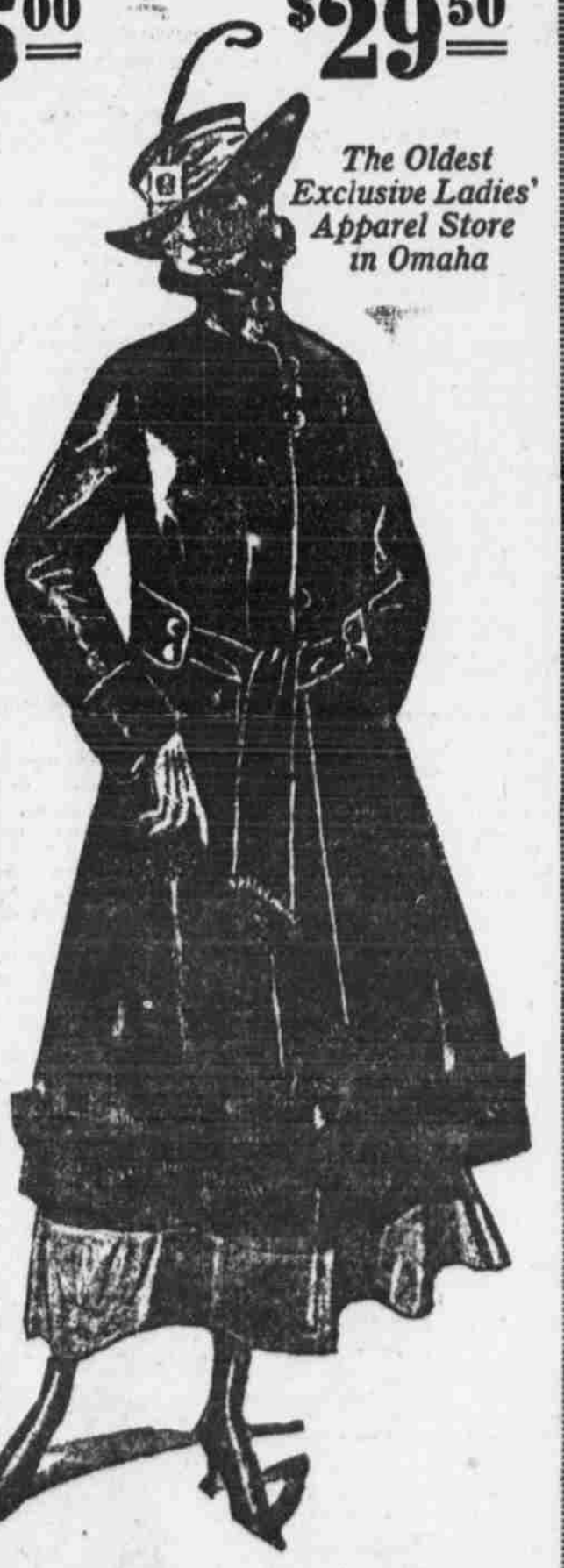
The Oldest Exclusive Ladies' Apparel Store in Omaha