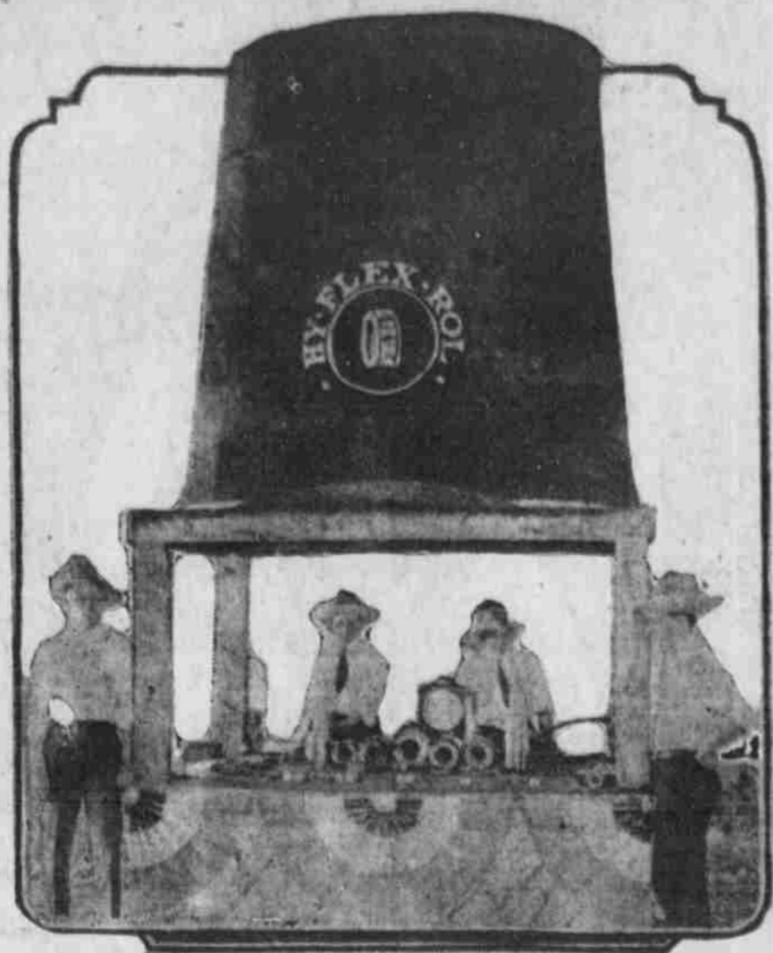
INTERIOR OF THE HYATT ROLLER-BEARING COMPANY'S TENT.