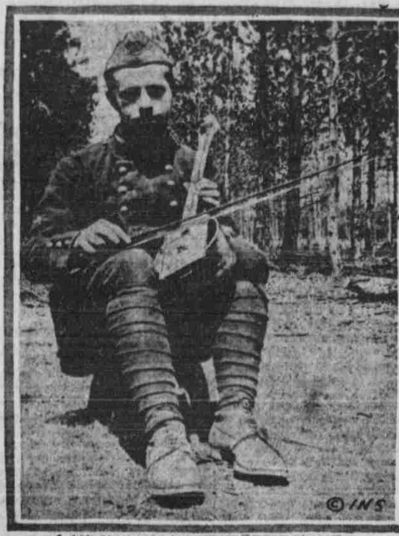
A MUSICIAN IN THE TRENCHES

MUSIC IN THE BELGIAN TRENCHES-That even war cannot stifle the soul of the real musician is demonstrated by this picture, made on the Belgian firing line. This Belgian soldier has constructed a violin, using a tin kettle, a cigar box and a piece of telegraph wire.