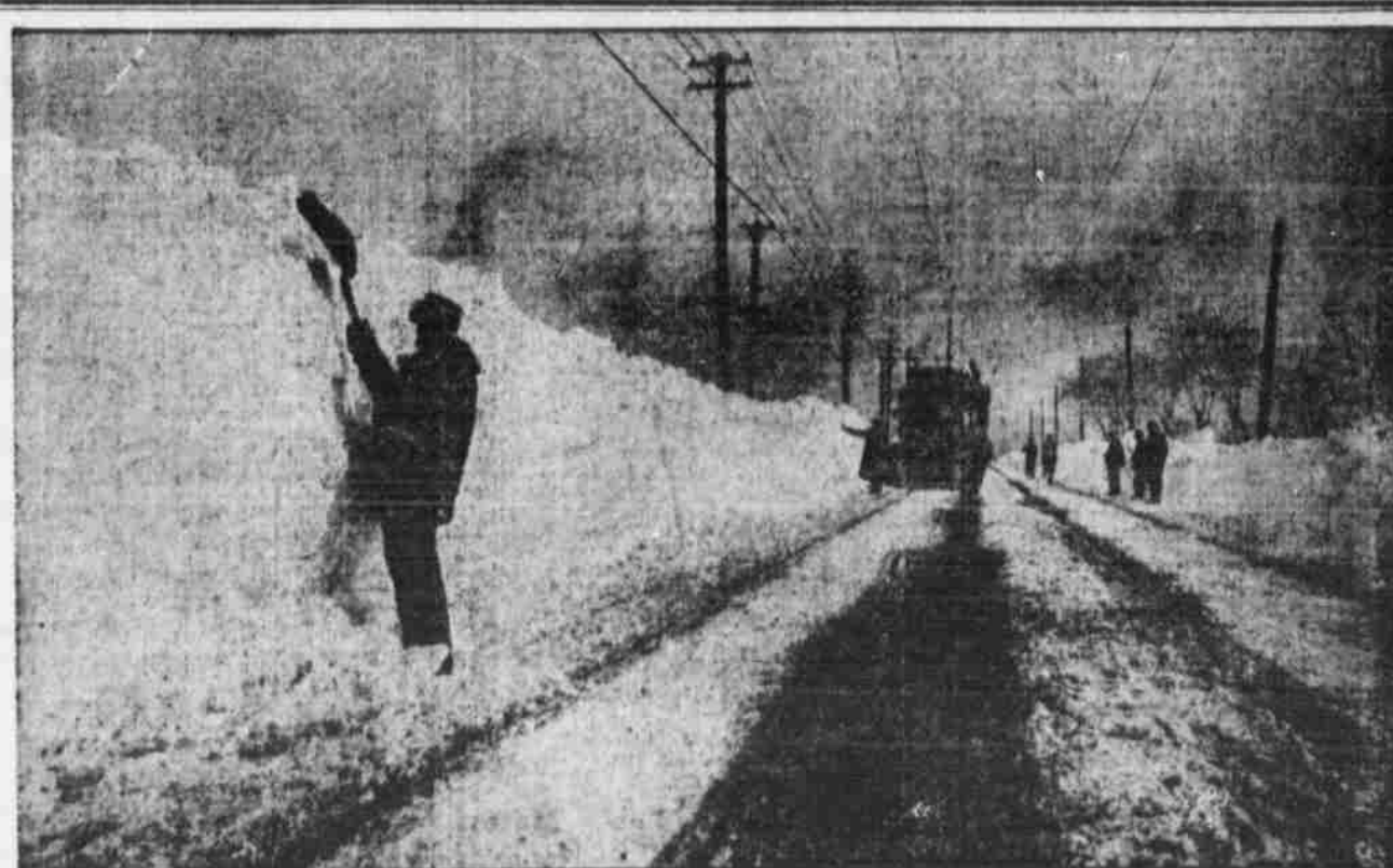
Snow Dritt Seven Feet High, 36th and Q Streets, South Omaha, February 2, 1915.

The above picture illustrates some of the difficulties of operating street cars at this season of the year.