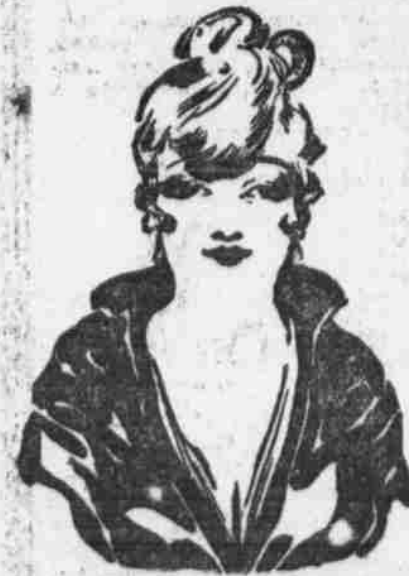
You Could Have Seen the Pimples I Used to Have. Ugh! The Wasty Things!"

or two days. They reach down into the blood, clean it as one does dirty linen, throw off all impurities in a natural way and thus the blood does not fill the skin with eruptions and discolorations in its attempt to get rid of injurious waste.