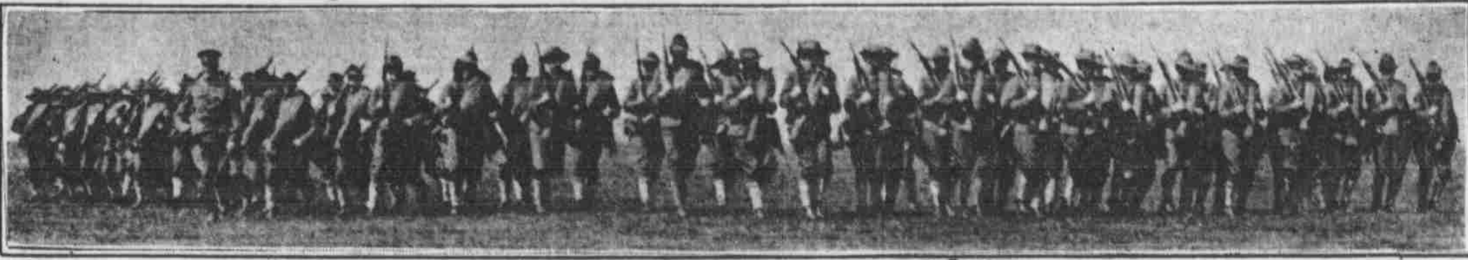
American Soldiers Drilling in Texas.