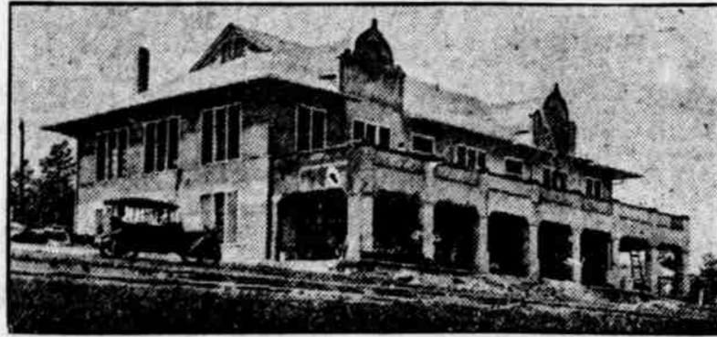
THE NEW CLUB HOME OF THE SEYMOUR LAKE COUNTRY CLUB WHEN THE COMMERCIAL CLUB WAS ENTER-TAINED AT LUNCHEON.

The people of Ralston take pride in the fact that this little town never has had a boom. They do not want it to have one; they want it to grow,