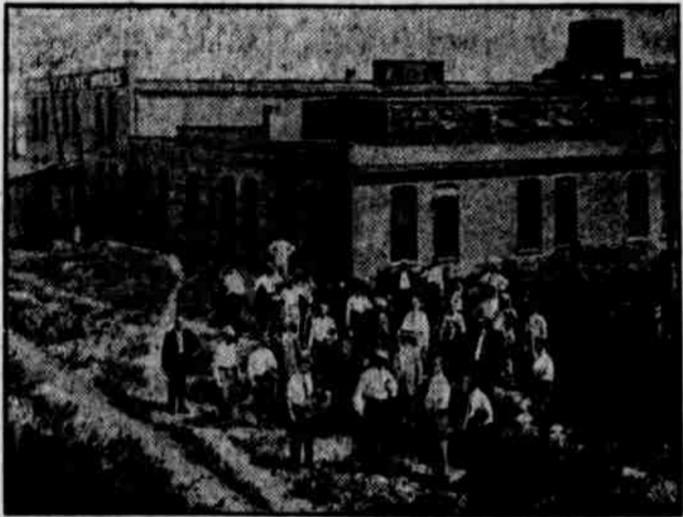
FIRST SECTION OF COMMERCIAL CLUB DELEGATION INSPECTING HOWARD STOVE WORKS.

Ralston is destined to grow—destined to become one of the best known manufacturing cities, in connection with Omaha, there is in the west. And always remember that as Ralston grows, so does Omaha. For Ralston is a part of Omaha, though not in corporate body, yet in spirit