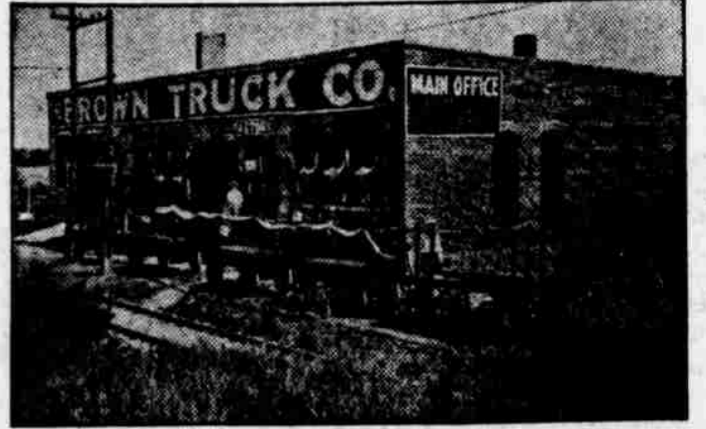
THE FACTORY OF THE BROWN TRUCK COMPANY.

What has been done in this thriving little town is not all in all. It is the future which holds out substantial prospects for the people here. Ralston is going to grow; it is going to have more industries. The natural advantages of Ralston make it one of the best sites in the west for manufacturing plants; it has the essentials for the home of big industrial plants, and the present is only a suggestion of what is to come in this little, sturdy support of Omaha that has advanced many fold during the last few years and that is certain to go ahead with greater strides during the years of the immediate future.