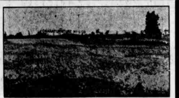
Excavations for Our New Factory

After looking over the Omaha field we decided that no better location could be found than amid the extensive distributing facilities afforded by this city. About September 1st we expect to commence to manufacture, in our new plant, a complete line of furniture that the housewife will find use for in her kitchen, library and parlor.