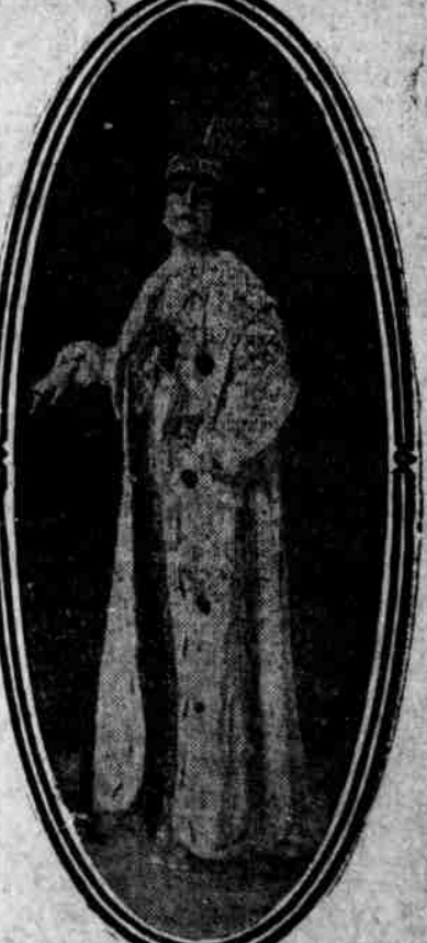
Miss Valeska Suratt in Her $11,000 Chinchilla Cloak That Made Even New York Gasp in Astonishment.

Next Sunday will begin this incomparable series. No woman can afford to be without it. It means the end of the ceaseless search for beauty that so many women have failed to find. Every woman, putting Miss Suratt's simple methods into practice, can achieve what she has believed never could happen to her. It will be readily seen after you have read these chisels that any woman however bereft of personal charms may surely acquire them by a mere determination to do as instructed.