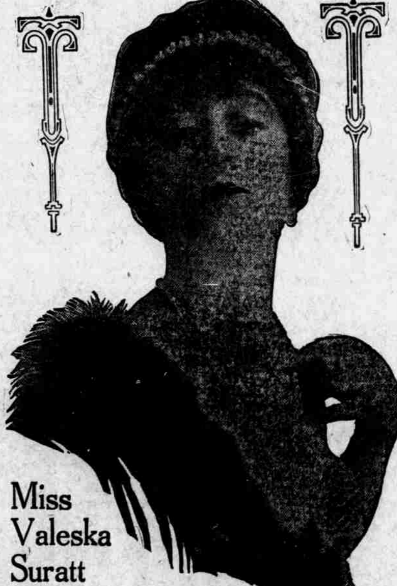
Miss Valeska Suratt

Valeska Suratt, the Most Captivating Actress on the American Stage, to Unriddle Her Magic Art of Self-Made Loveliness to the Readers of The Sunday Bee.