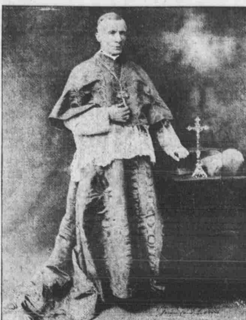
JAMES CARDINAL GIBBONS.