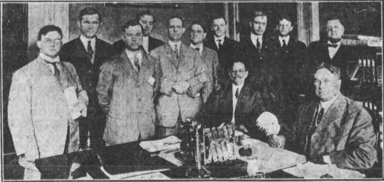
GOVERNOR JOHNSON SIGNING THE BILL APPROPRIATING $200,000 FOR THE CALIFORNIA STATE BUILDING AT THE PANAMA-CALIFORNIA EXPOSITION, TO BE HELD AT SAN DIEGO IN 1915—WITH GOVERNOR JOHNSON ARE COMMISSIONER HALLORAN, REPRESENTING THE EXPOSITION ASSOCIATION, AND MEMBERS OF THE LEGISLATURE FROM SOUTHERN CALIFORNIA.

sided to have the Alameda county exhibit in Omaha again."