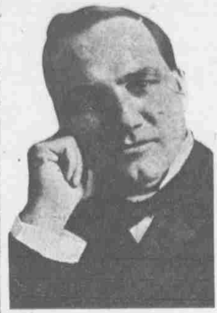
E. J. BURKETT, Retiring United States Senator.