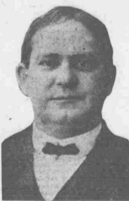
NORRIS BROWN, United States Senator.