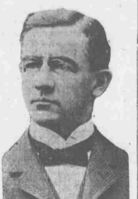
G. M. HITCHCOCK, United States Senator.