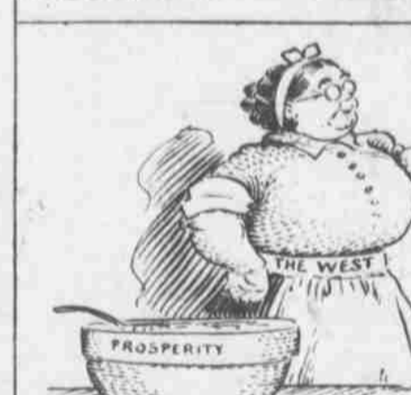
Events of the Week, as Viewed by The Bee's Artist.