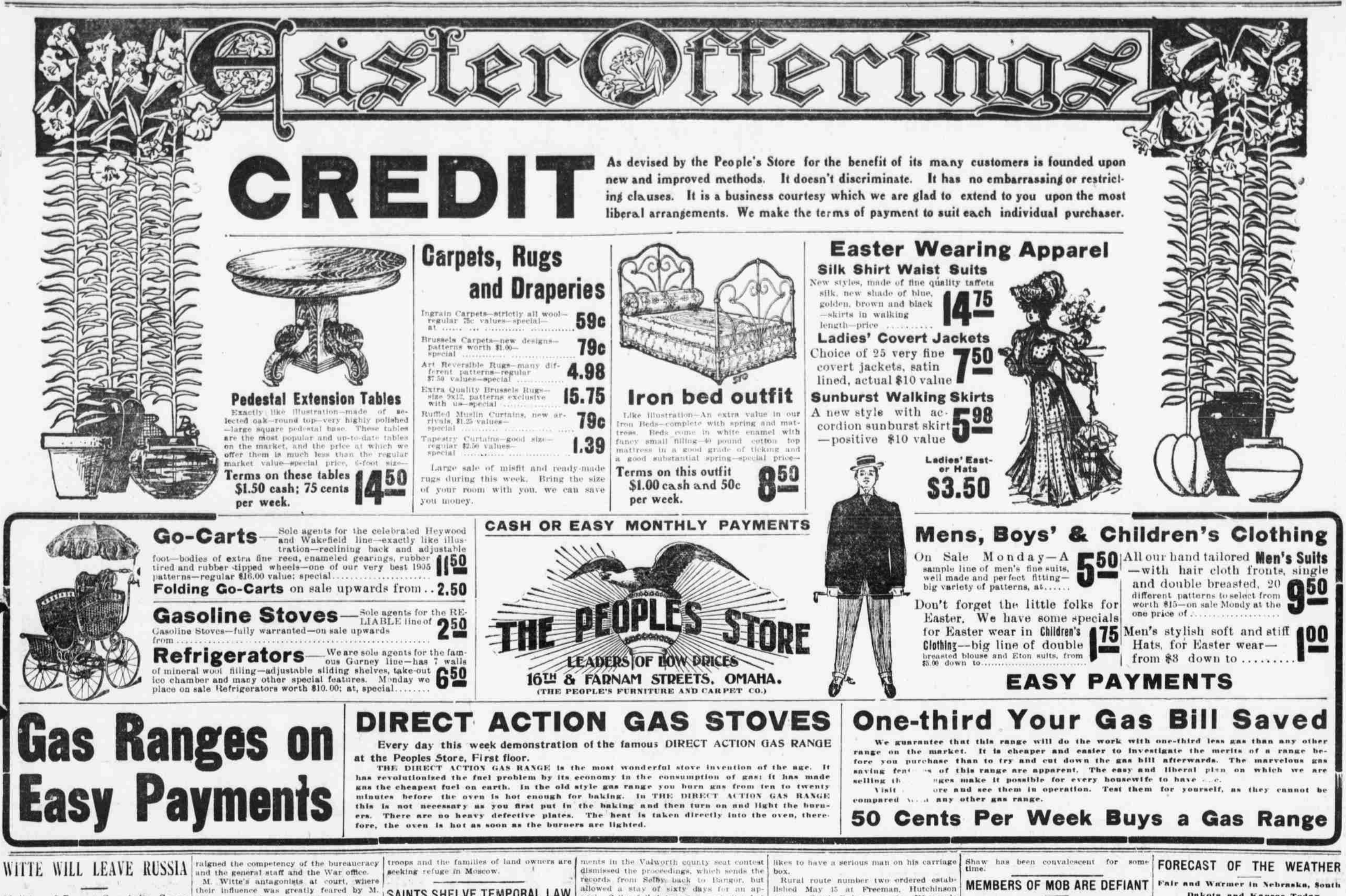
THE OMAHA DAILY BEE: SUNDAY, APRIL 16, 1905.

Statesman to Become Discouraged. PROPHETIC PICTURE IN NEWSPAPER