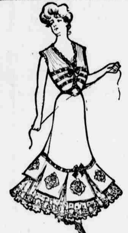
THE BOLERO CORSET COVER

Here is showed the latest conception in combination chemise and short petticoat,