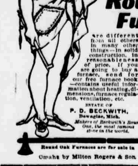
Round Oak Furnaces are for sale in Omaha by Milton Rogers & Son.

Round Oak Furnaces have large feed doors, burn wood or coal; but whatever they burn, give greater heat than any other furnaces.