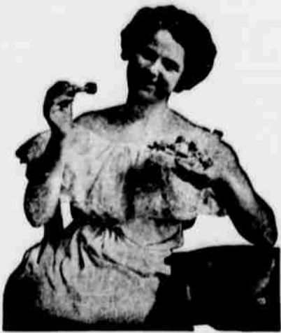
All the Ladies Eat