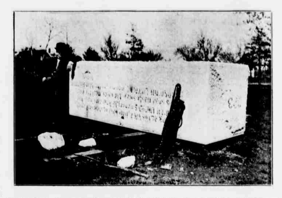
due to cover expenses he had personally met, what it called your tyrannical method of TENNESSEE MARBLE FOR LINCOLN MONUMENT, SHOWING INSCRIPTION

"How did you feel," Theodore Dreiser when the entire democratic press