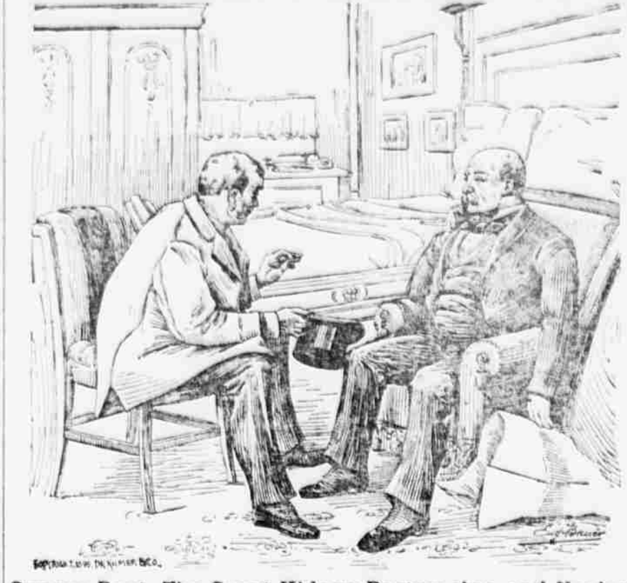
Swamp Root, The Great Kidney Restorative and Healer.