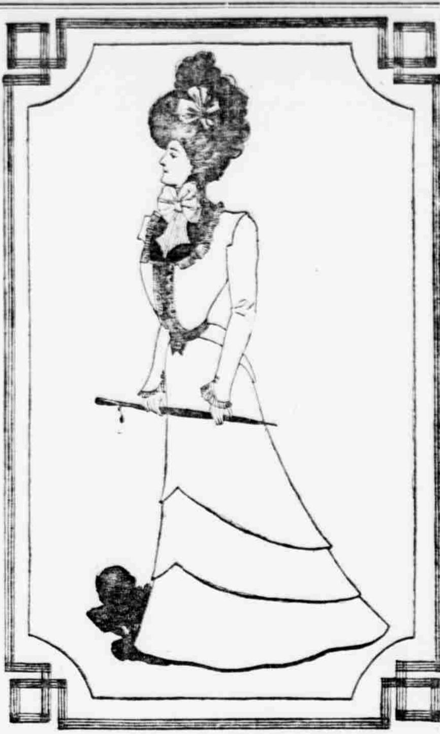
BLACK CLOTH FAUTUMN COSTUME FROM HARPER'S BAZAR

CALIFORNIA FIG SYRUP CO. SAN PRANCISON ON