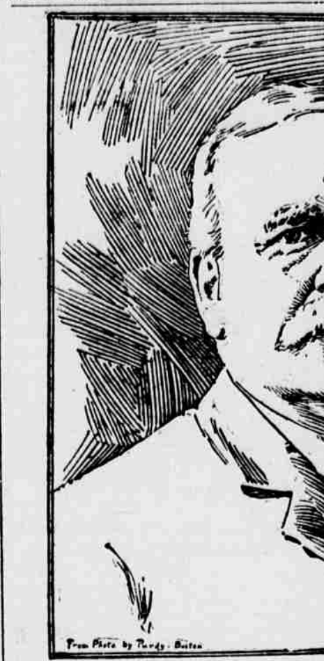
SECRETARY LONG AS HE IS TODAY (AGE 60.)

It was improved to the utmost in putting the navy in thorough fighting trim. It may be said further, that every hour thus gained by the president's cautious policy was needed, and that the country is getting the benefit today of the preparations which were carried on under cover of the diplomatic negotiations.