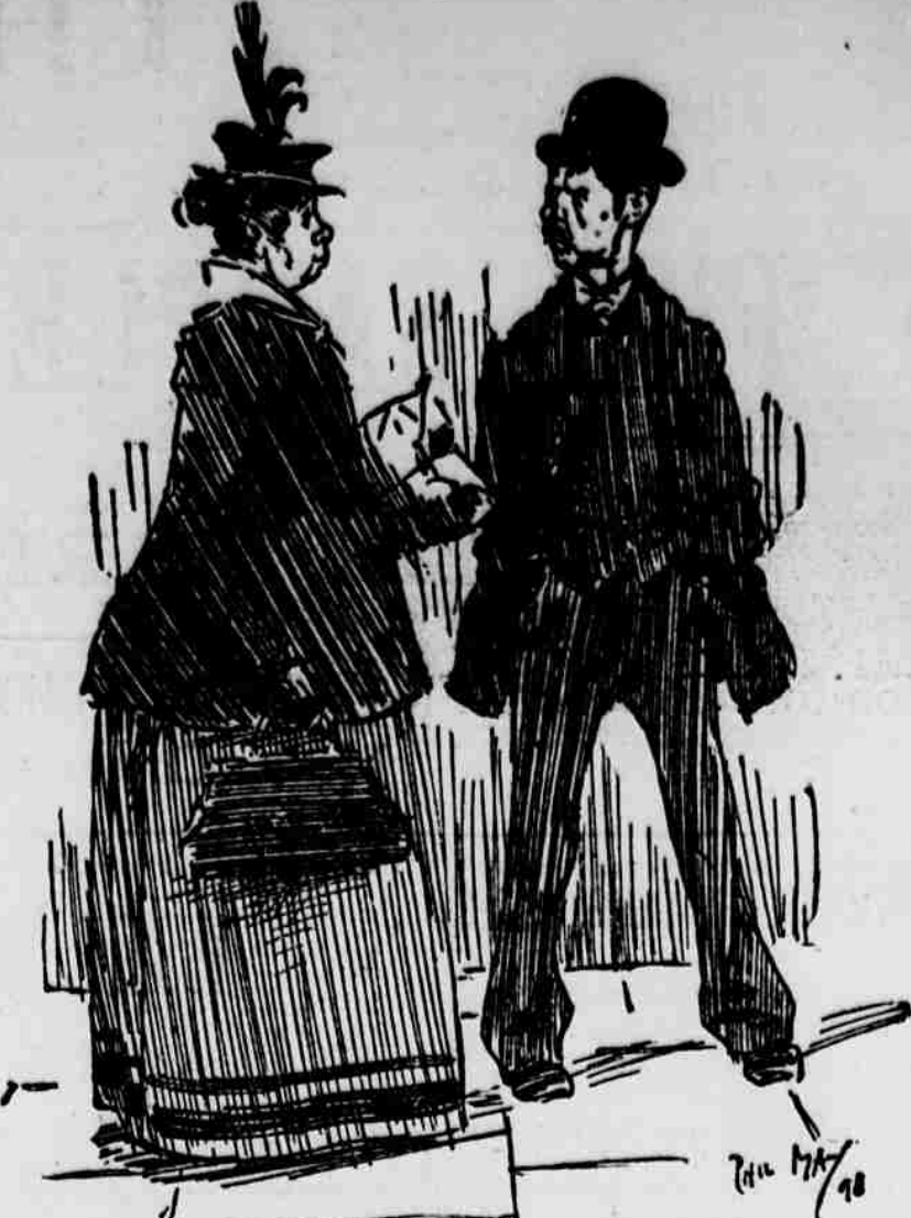
Arry (whose "Old Dutch" has been snapping, and has kept him waiting a considerable time.)—Wot d'yer mean, keep'n' me standin' 'aboot 'ere like a bloomin' fool? Arrriet—'can't 'elp the way yer stand, Arrry!