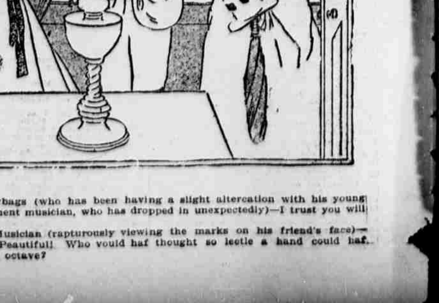
FINGER NAIL MARKS SHOWED HER REACH. From Scrap.