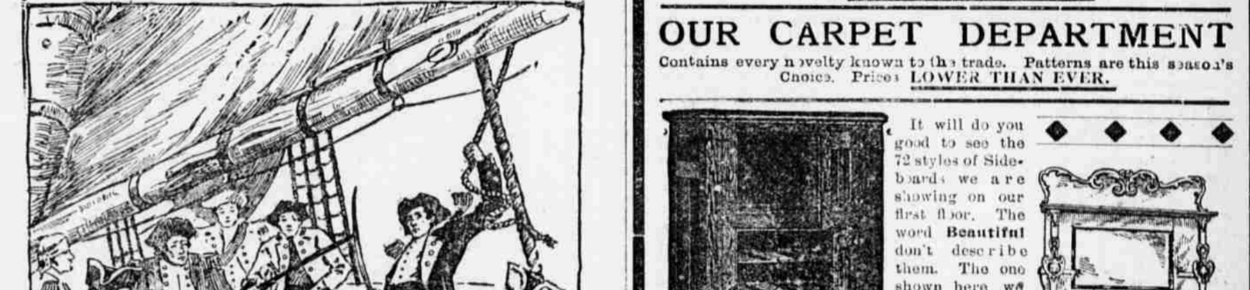
DALE SWING HIMSELF OVER.

appearance were depressed. In a little while they were sent back to Mill prison. Forty days in the black hole of the prison followed.