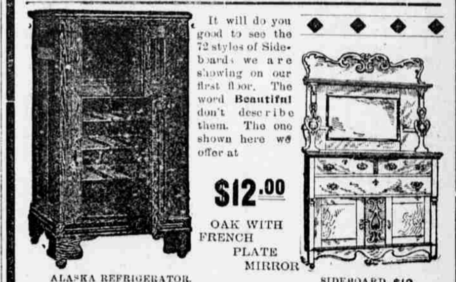
ALASKA REFRIGERATORS. Are the Best on Earth and cost no more than cheap traps.

OUR CARPET DEPARTMENT Contains every variety known to the trade. Patterns are this season's choice. Prices LOWER THAN EVER.