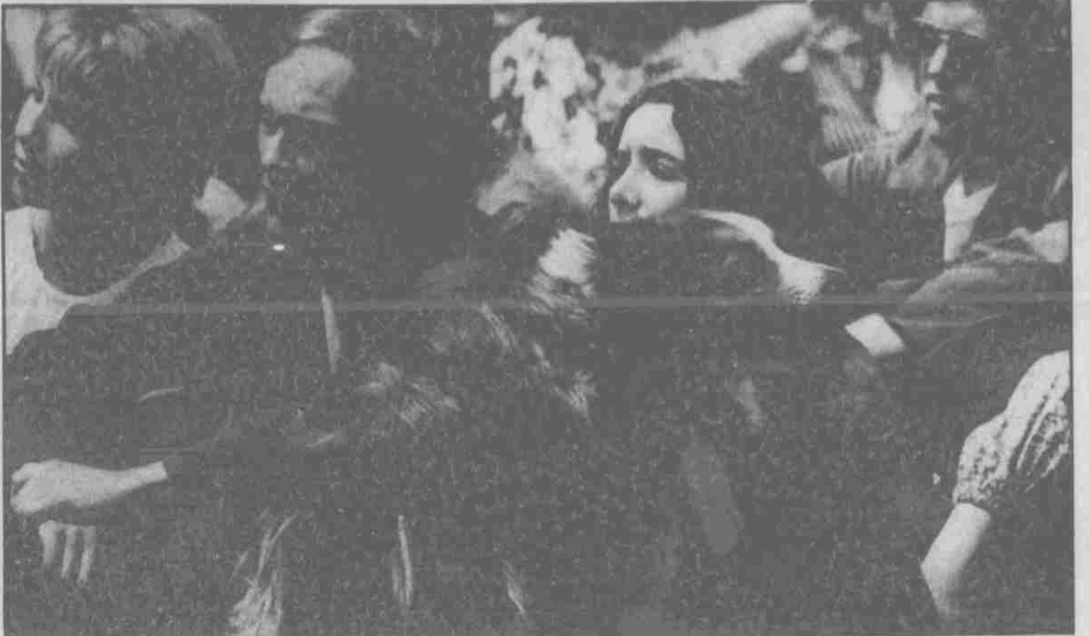
Women of the 1970s made great strides for Freedom. They tried new and daring things. This woman, however, was arrested for trying to wear a dog. Fashion is a risky business.