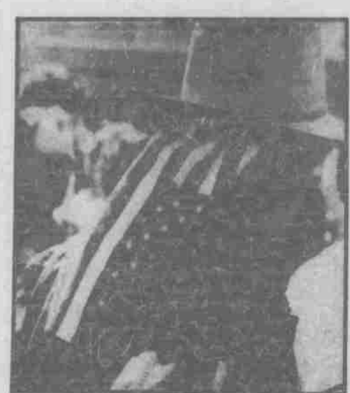
Never at a loss for innovating styles, men of the 1970s put a new twist on the hold "flag fashion" standard.