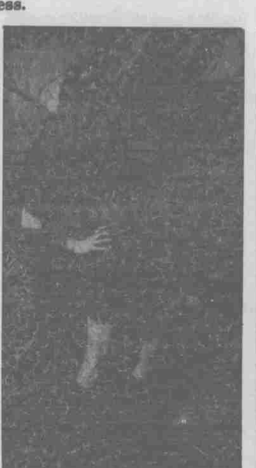
Where oh where is your suede fringed sunsuit? Popular with the nature women of the 1960s, this spunky ensemble is sure to make a comeback this year...check your closets, the mothballed boxes in your attic...