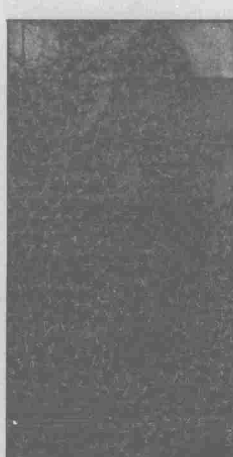
Her boots were made for walking, and this mod creature cultivated the Polyester Panic of the late Sixties: Will supplies of flamable fabric hold out through the Seventies?