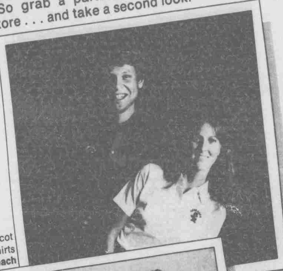
Mascot Sportshirts $22.95 each

Take another look . . . or two! The 1984 Big Red Collection has a couple great ideas for you for Fall! Double up on colorful, comfortable sportshirts, sweats and jackets — all in red and white and all priced just right. So grab a partner, get down to Nebraska Bookstore . . . and take a second look!