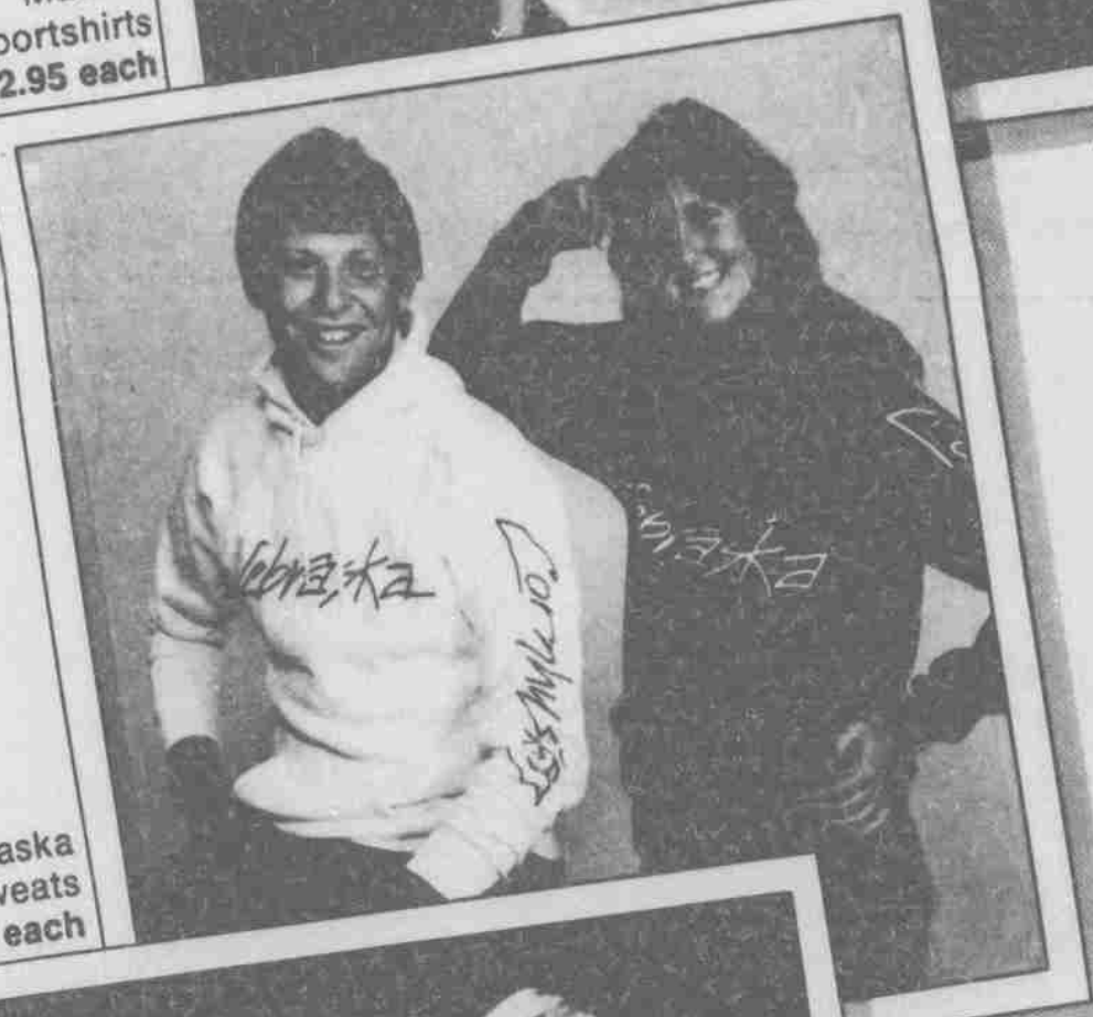
Nebraska Sweats $21.95 each