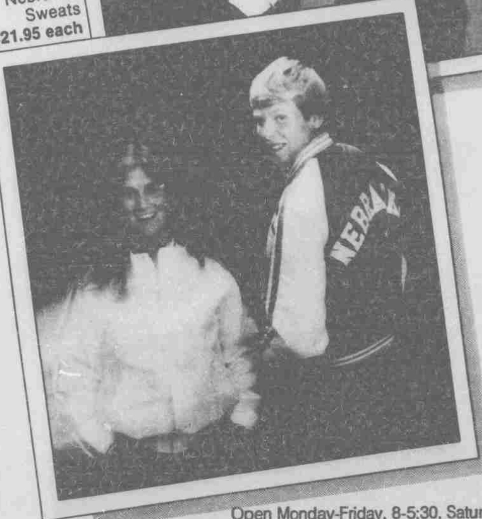
Award Jackets $46.00 each

Open Monday-Friday, 8-5:30, Saturday, 9-5:30