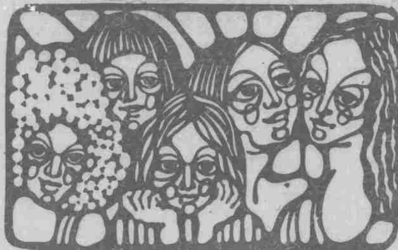
The Women's Resource Center offers Peer Counseling

Students interested in joining the club can call 472-5379 Monday through Thursday for more information.