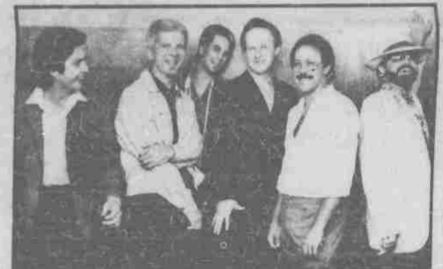
THE JUKE JUMPERS