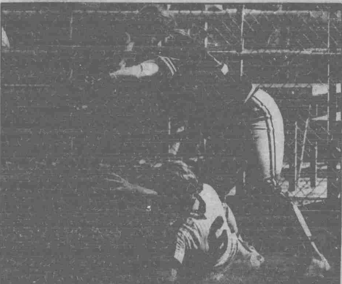
Daily Nebraskan Photos