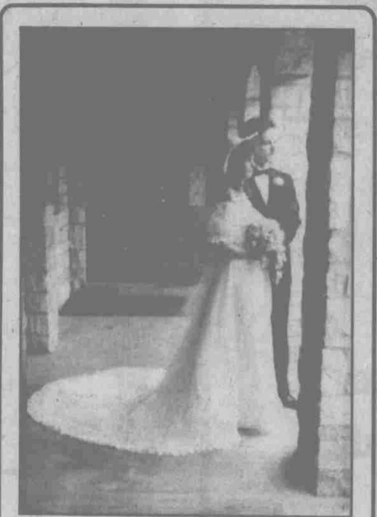
"Distinctive Wedding Photography" By