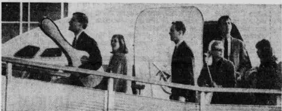
Going to swing this vacation? Don't take losable cash. Take First National City travelers checks. You can cash them anywhere. But their big advantage is a faster refund system. See below.

Other leading travelers checks, like First National City travelers checks, can be cashed all over the world.