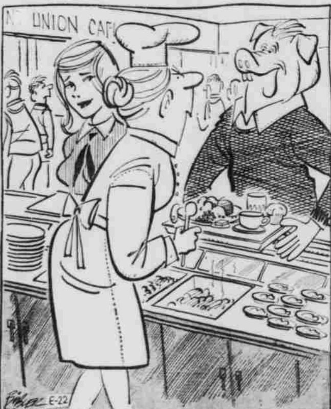
"I KNOW I'VE COMPLAINED A LOT ABOUT THE FOOD HERE, BUT NOW THAT I'M ABOUT READY TO GRADUATE I'M BEGINNING TO LIKE IT."