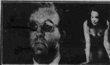
★ Why did Dr. Strangelove want ten women for each man?