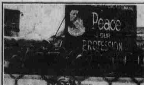
★ Why did U.S. Paratroopers invade their own base?