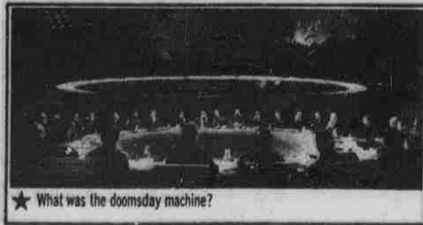
★ What was the doomsday machine?