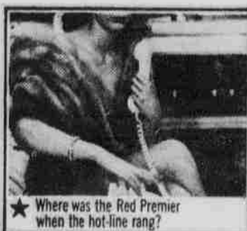
★ Where was the Red Premier when the hot-line rang?