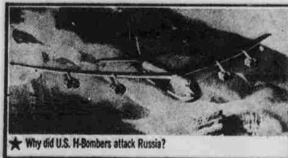
★ Why did U.S. H-Bombers attack Russia?