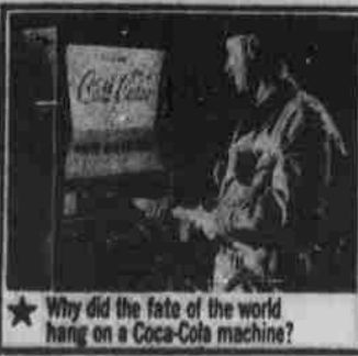
★ Why did the fate of the world hang on a Coca-Cola machine?