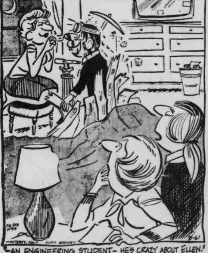
"AN ENGINEERING STUDENT - HE'S CRAZY ABOUT ELLEN."